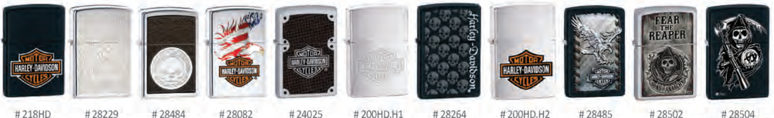
# 218HD # 28229 # 28484 # 28082 # 24025 # 200HD.H1 # 28264 # 200HD.H2 # 28485 # 28502 # 28504

FREE Shipping on all Orders. All Sales are FINAL.